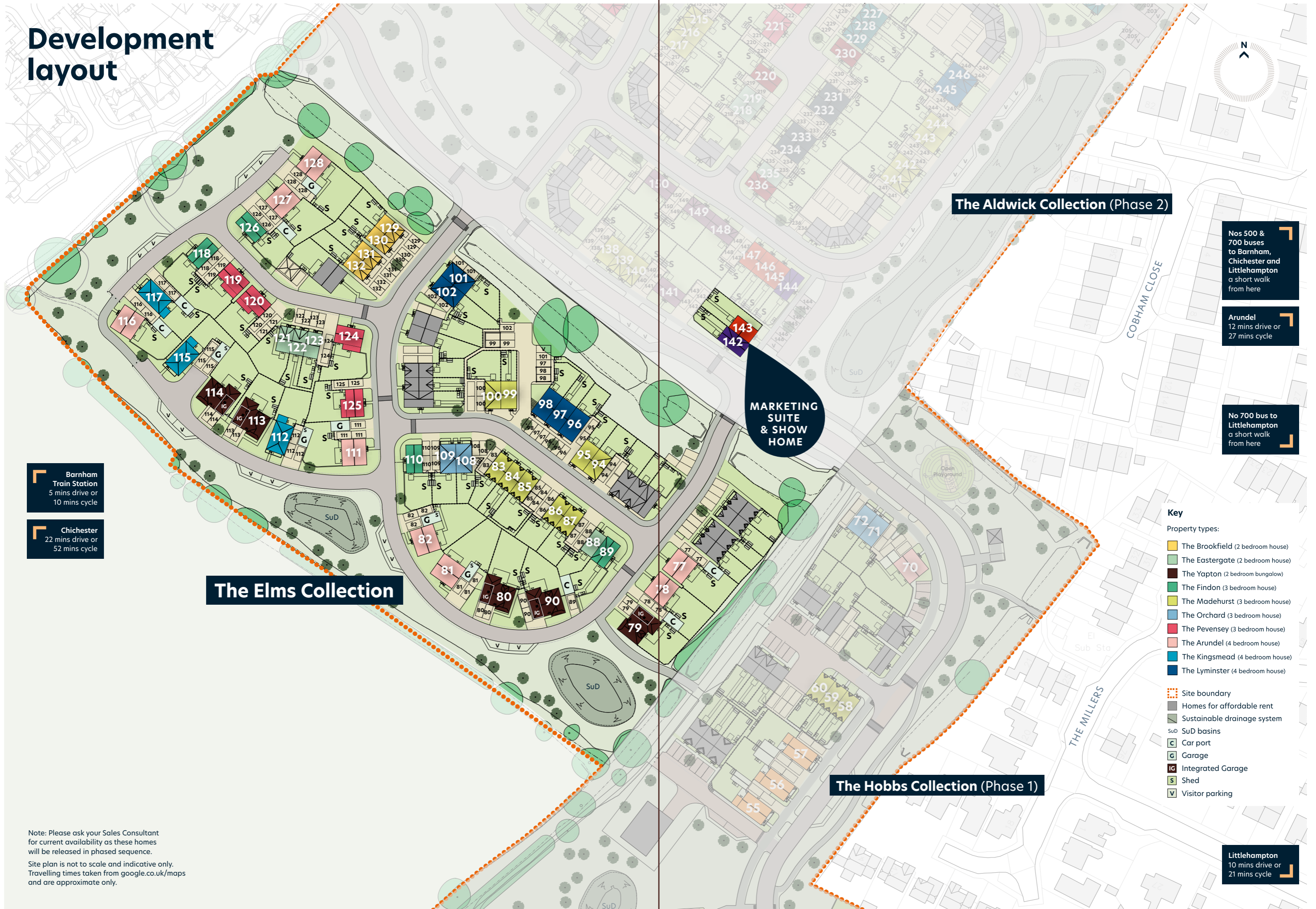
The Aldwick Collection (Phase 2)